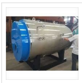
Oil / Gas Industrial Steam Boilers