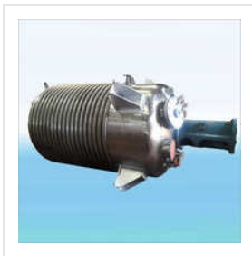
Reactor Pressure Vessel