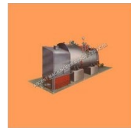
IBR SOLID FUEL FIRED STEAM BOILER