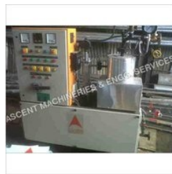
NON-IBR ELECTRICAL BOILER