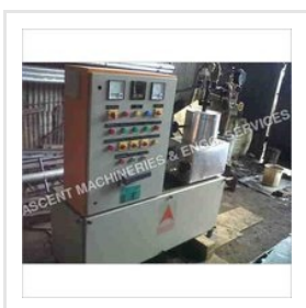
IBR Electrode Boiler