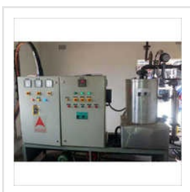
Electrode Steam Boiler