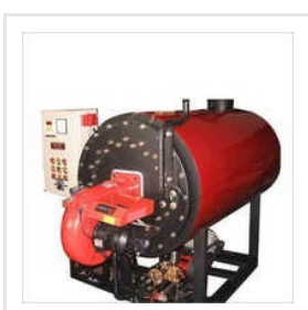
IBR Fuel Fired Steam Boiler