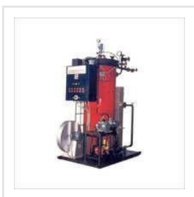
NON-IBR Oil Fired Steam Boiler