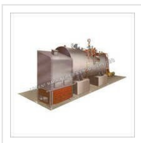
IBR Waste Heat Boiler