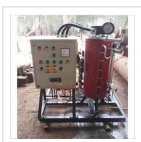
Non IBR Electrical Steam Boiler