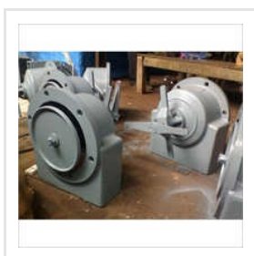
Cooling Tower Spares