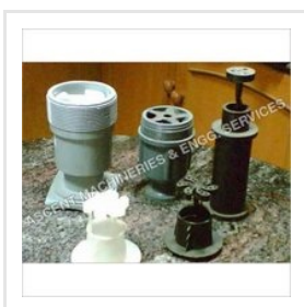
Cooling Tower Spares