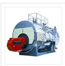
Industrial Steam Boiler